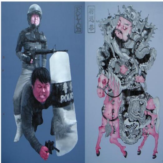
Clockwise from top: Trip on the Road No. 32 , Oil on Canvas (2006) 42 x 39 in.; Trip on the Road No.12 , Oil on Canvas (2006) 47 x 32 in.; Cool God of Gates No. 4 , Oil on Canvas (2006) 79 x 59 in