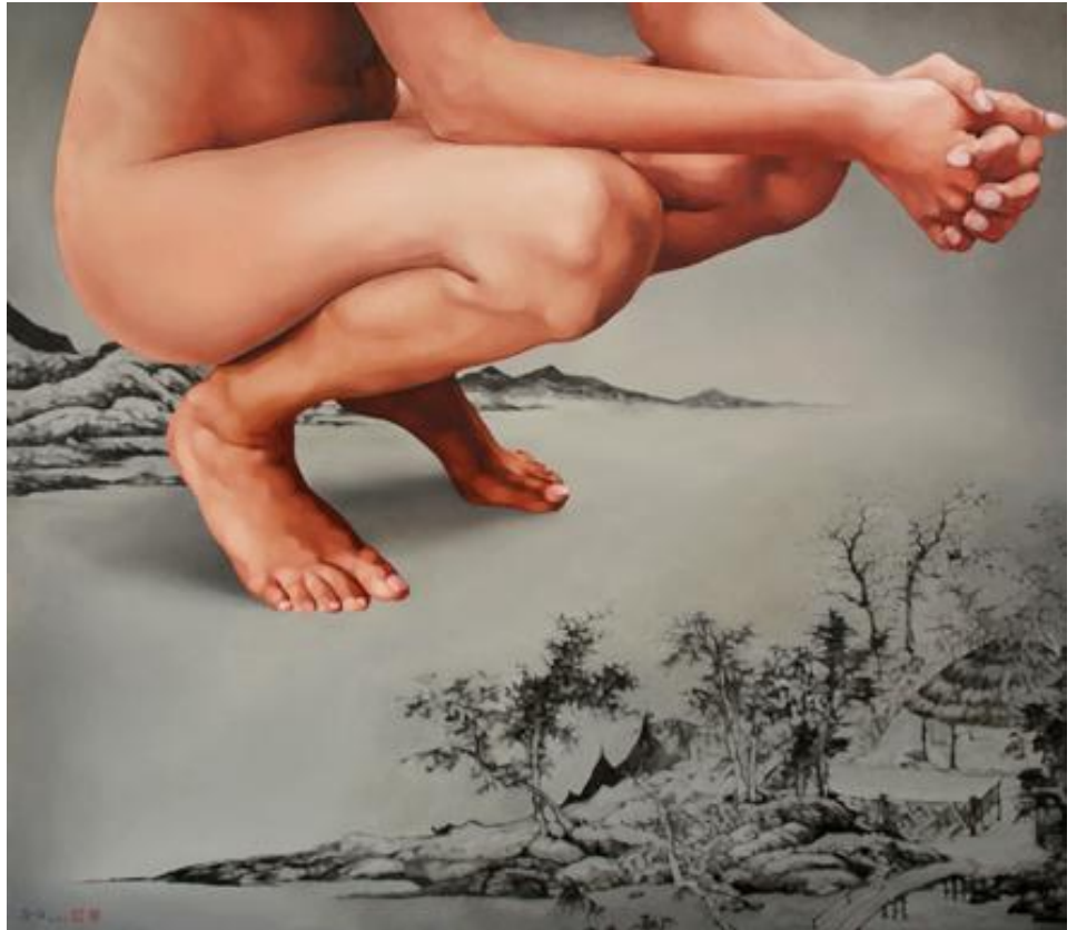
Trip on the Road No.54, Oil on Canvas (2007) 88 in x 78 in

PYO GALLERY LA 1100 S. Hope Street, Suite 105, Los Angeles, CA 90015 USA +213.405.1488 † +213.405.1489 † info@pyogalleryla.com