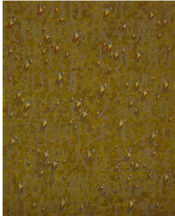
RECURRENCE 08011, 64" x 51", Acrylic & Oil on Canvas, 2003