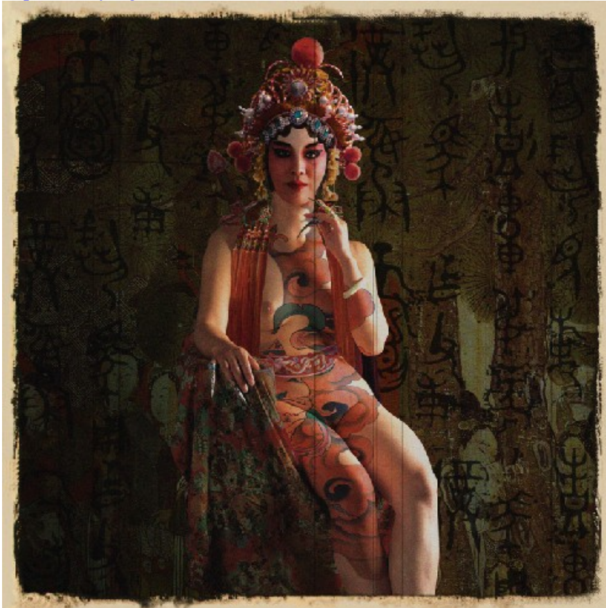
Playing Chinese Opera all my Life Series, 2006 , 108-108cm, color print