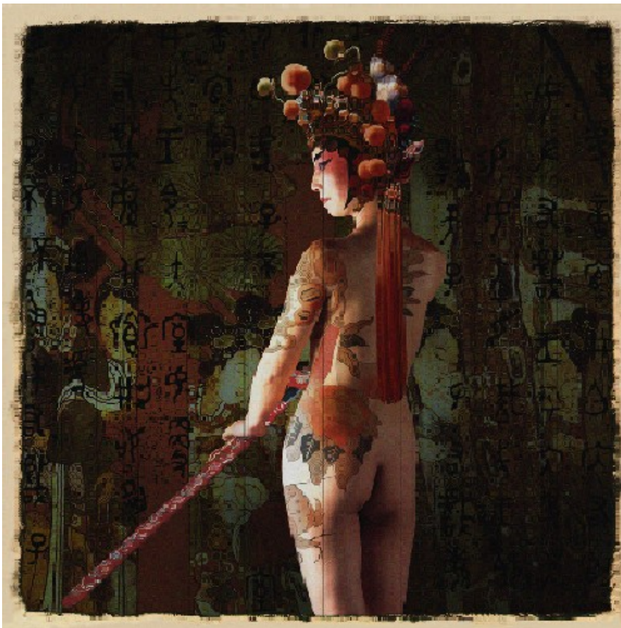
Playing Chinese Opera all my Life Series, 2006 , 108-108cm, color print