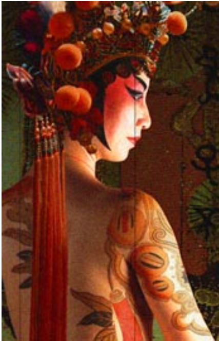
Woman with Sword No. 1