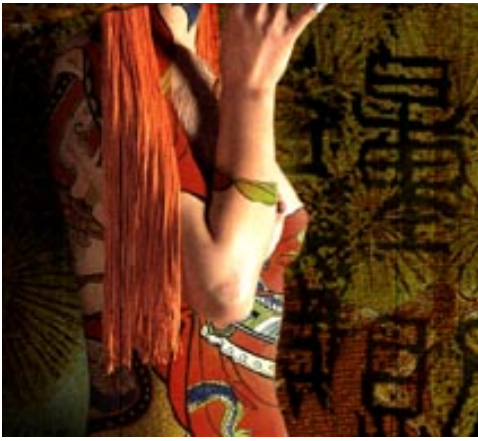
2006 , 108-108cm, color print