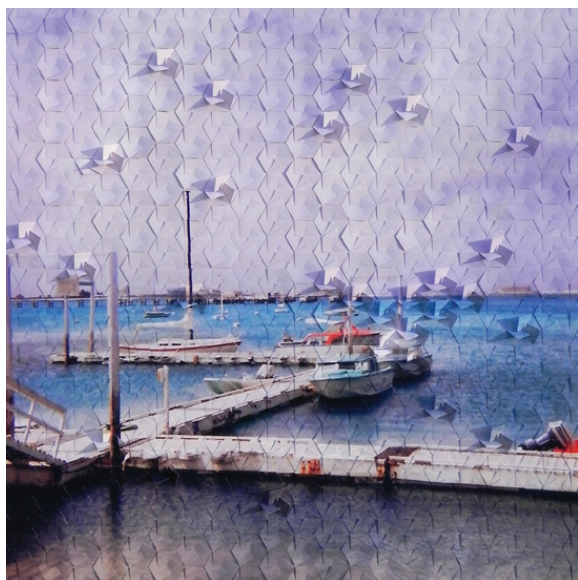
Between Two Worlds, 2010, photographic reconstruction 48 x 48 inches